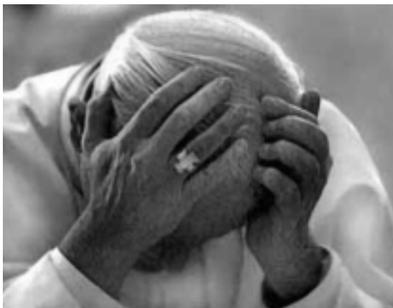
John Paul II fails a piety check.